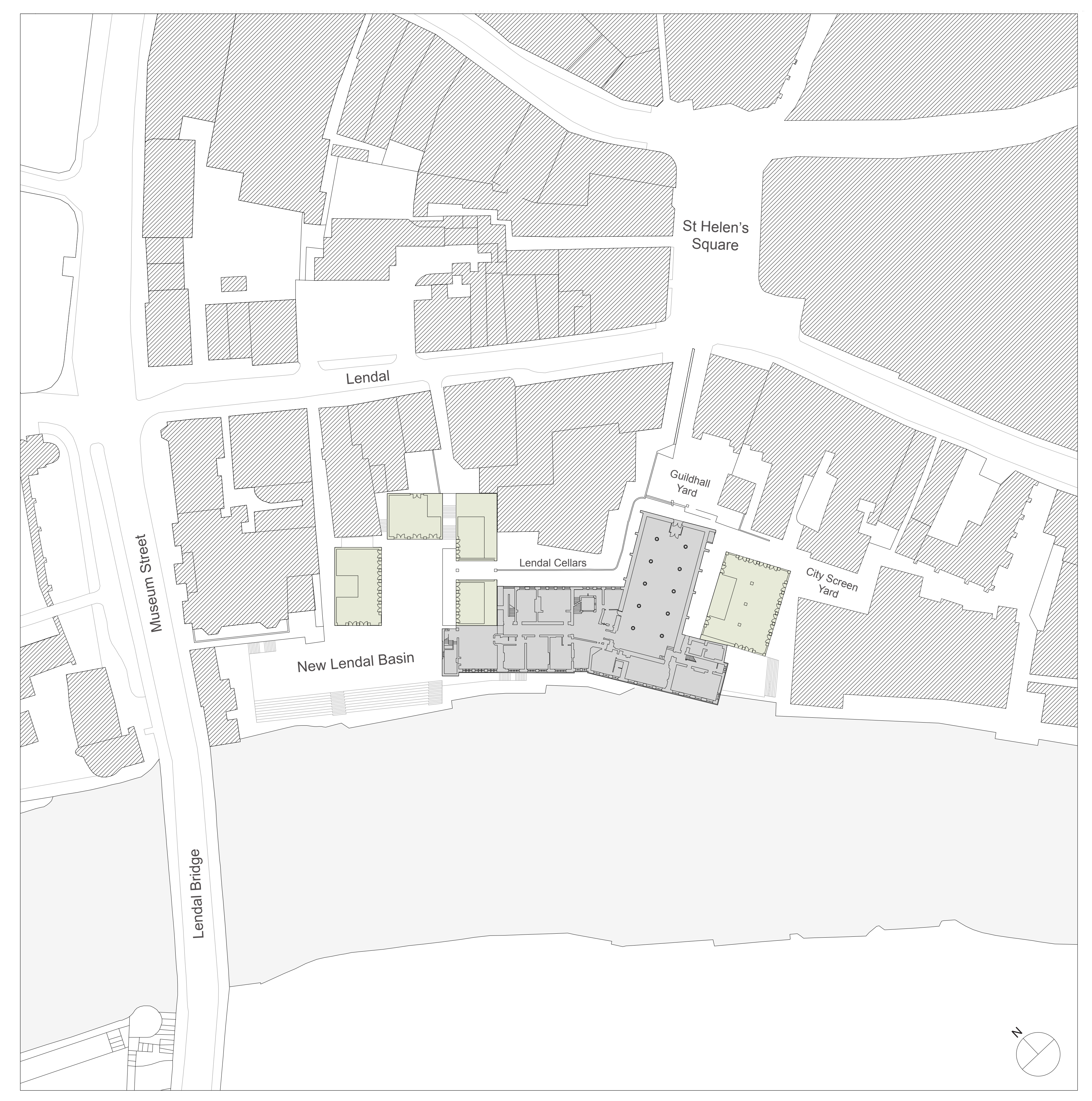
Proposed 1.500 site plan showing new buildings and public spaces addresing the river